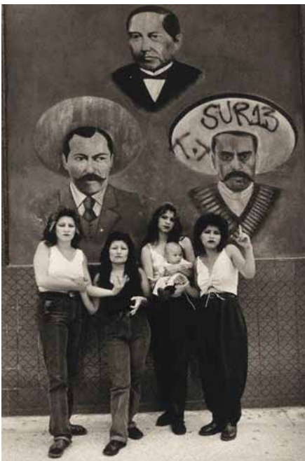
Cholas, White Fence, East L.A., Graciela Iturbide. Negative, 1986; print, late 1990s.