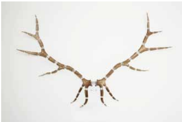
Improved Rack (Elk #14) , Michael Joo, 2008. Antlers, stainless steel, 96 x 57 x 19 in. (243.8 x 144.8 x 48.3 cm)